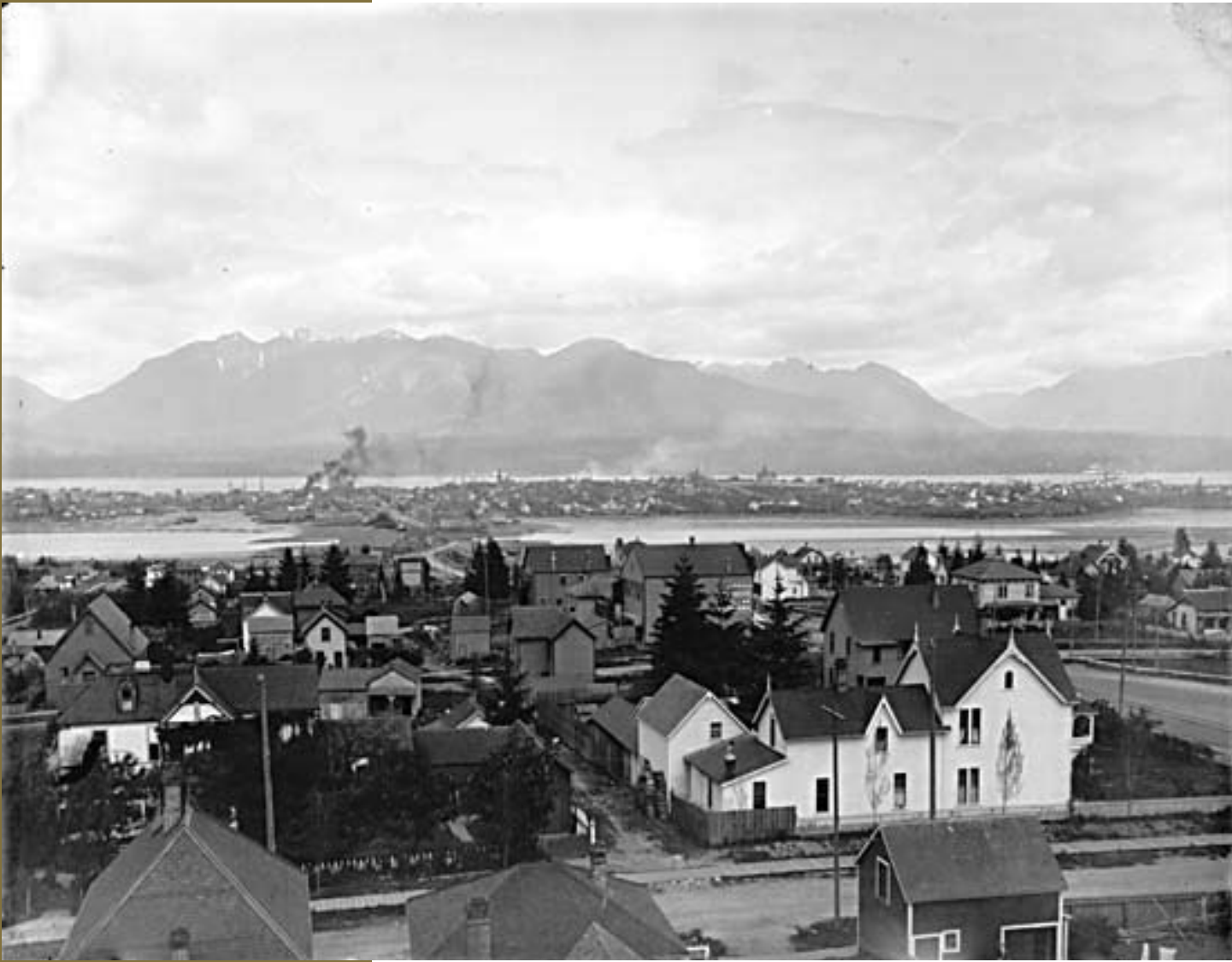
The 1899 Depencier House when it still faced Main Street [LGN 1052 CVA]

Remarkably, Mount Pleasant still has many of the buildings that were built at this time during the reign of Queen Victoria, who died in 1901. No attempt has yet been made to systematically identify Mount Pleasant's Victorian buildings. In 2008, historian Bruce Macdonald researched on his own a number of older buildings within a block of Mount Pleasant's original intersection where 7th Avenue, Main Street and Kingsway intersect. He found some of the oldest buildings in the city. Just east of Main Street at 151 East 8th Avenue on the lane is the 1889 Depencier House, the oldest occupied single family residence in outside of the downtown area.